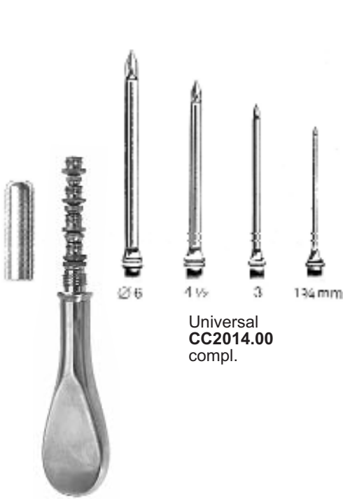
Universal CC2014.00 compl.