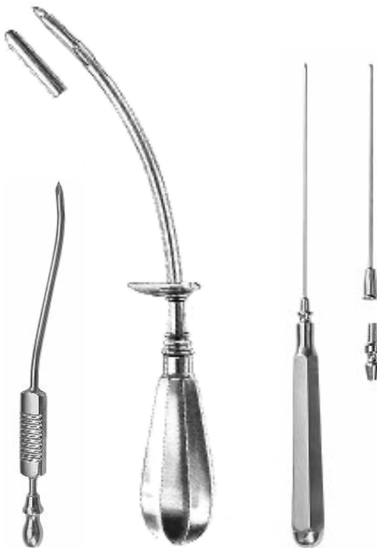
DOUGLAS CC2215.11 3 mm Ø