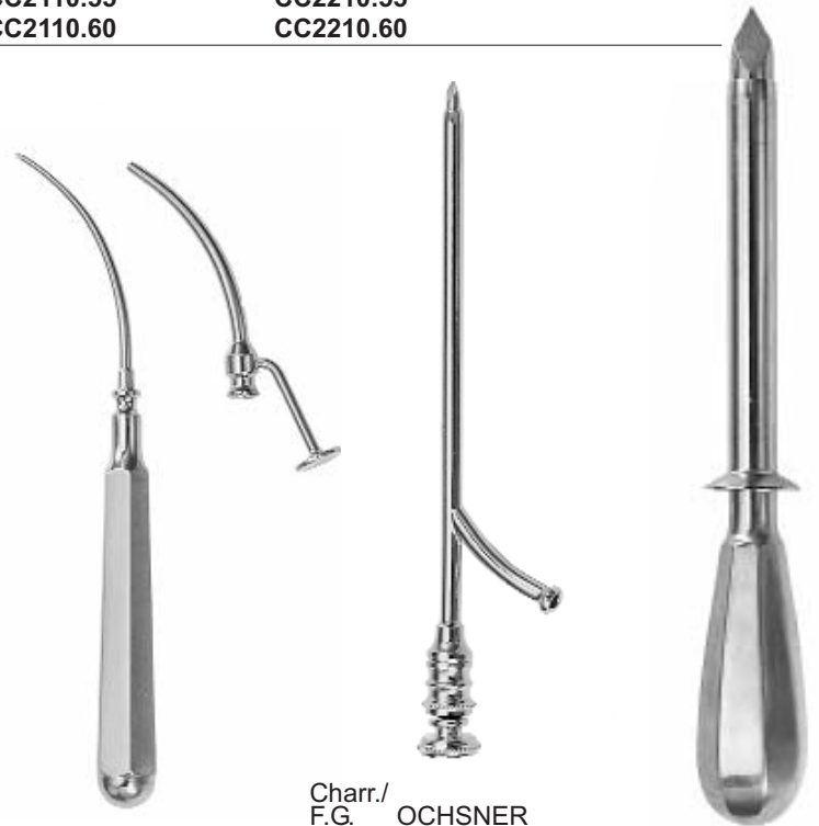
COAKLEY CC2410.02 2,25 mm Ø